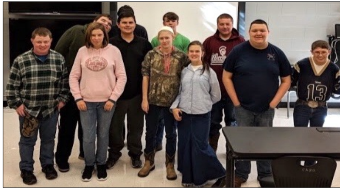
Special Students Helping Special People and Pets

Like us on Facebook Friends of White County Animals Sign Up for our FWCA Newsletter on our website: friendsofwhitecountyanimals.org PO Box 6231 Sparta, TN 38583 Contact us: friendsofwhitecountyanimals@gmail.com A 501(c)3 non-profit organization